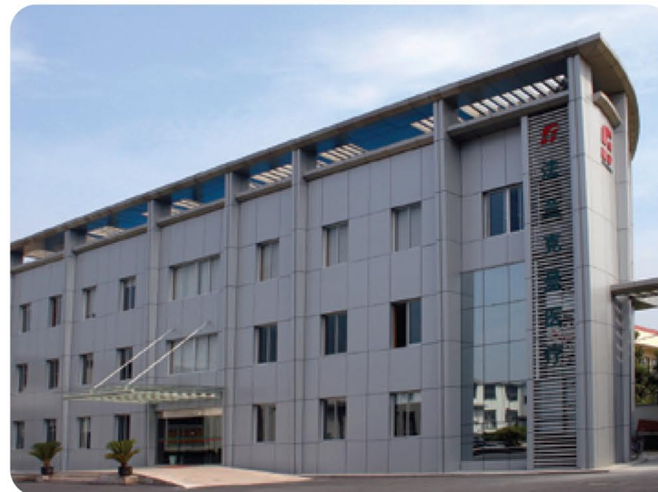
State-of-the-art manufacturing facilities.

WHEN YOU PUT PATIENTS' HEALTH FIRST, REMARKABLE THINGS FOLLOW