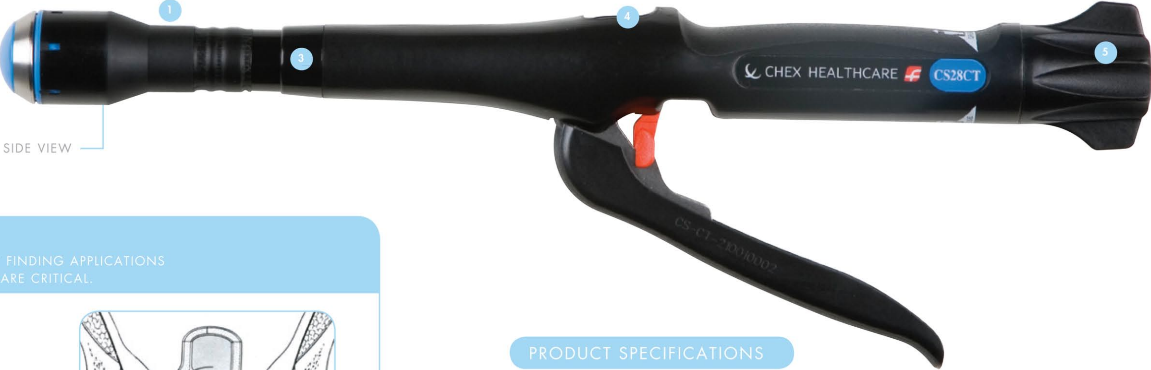
THE CHEX ™ CS COMPACT ™ CIRCULAR STAPLER ACTUAL SIZE