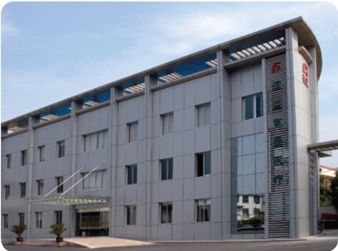
State-of-the-art manufacturing facilities.

At Frankenman, we believe we're not so much in the business of making instruments but in the business of making surgeries more successful. That's why we listen to doctors who've put our instruments to use. We read their reports. We invite them to think with us, to brainstorm, to help us develop new and innovative ideas. That way we know we will be able to deliver the highest quality products to the medical profession both today and way into the future.