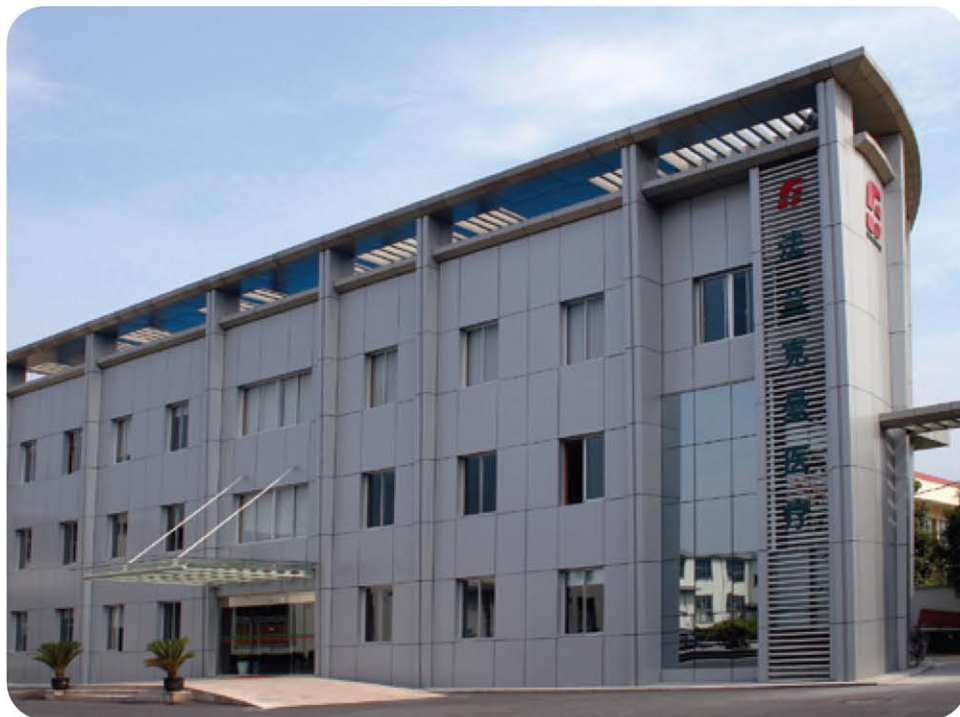
State-of-the-art manufacturing facilities.